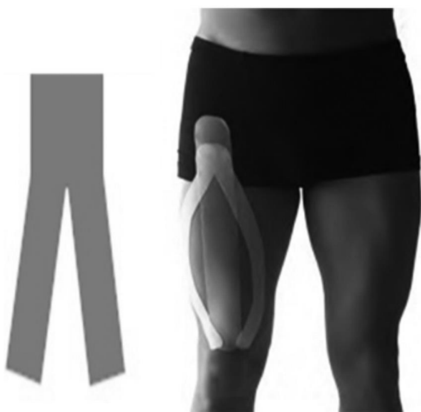
Figure 1. Demonstrative of applying kinesio taping with "Y" shape tape.