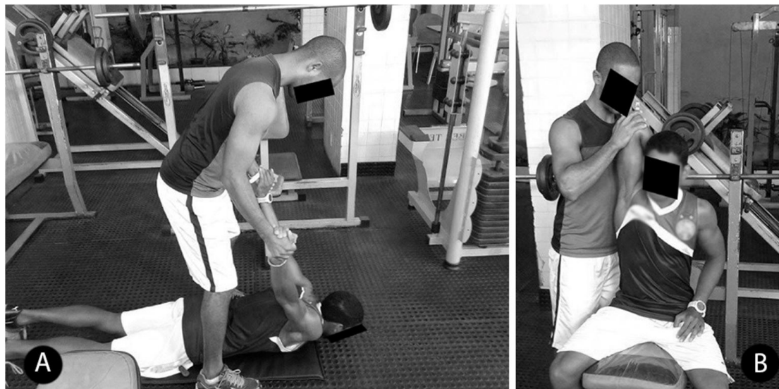
Figure 2. Flexion protocol. Note: A) Pectoral Flexion Protocol. B) Triceps Flexion Protocol.

obeyed the simple randomization, which was performed on the day the participants performed the protocols.