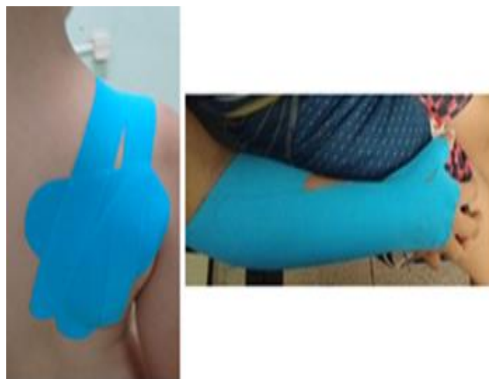
Figure 2. Application of Functional Bandaging.

wrist and finger extension (Figure 2) since hemiparetic patients present a flexor pattern of the upper limb with internal rotation and adduction of the shoulder, elbow flexion, wrist and finger pronation and flexion (34,35) . This pattern installs due to the spasticity present in the antigravity muscles, giving rise to abnormal posture and movement patterns (34,35) . The first application was on day one of treatment, after an initial test in case of elastic band allergy; the child remained with the tape until it began to spontaneously release, after removal it was waited for at least 24 to 48 hours for replacement, avoiding skin lesions (38) . The biomechanical evaluation was carried out before and after treatment. The child underwent three evaluations in total: one day before the start of treatment (A1) in which the biomechanical evaluation was performed and the application of the PAFT, INMAP and PMAL scales, last day of therapy in which all scales were reapplied and the biomechanical assessment of handgrip strength (A2) was redone and 30 days after the end of the ICT in which the PMAL scale (A3) was reapplied.