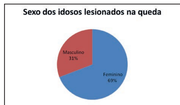
Graph 2. Gender of the elderly victims of falling in public transport Maringa in the period 2005-2012.