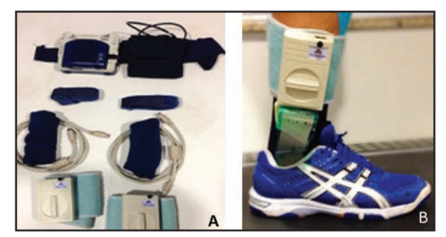
Figure 2. A - complete system of dynamic baropodemetria, B - peripheral system consists baropodometry insole and socket signal capture.

The contact pressure, which is the force unit divided by the area unit and plantar peak pressure (PP),