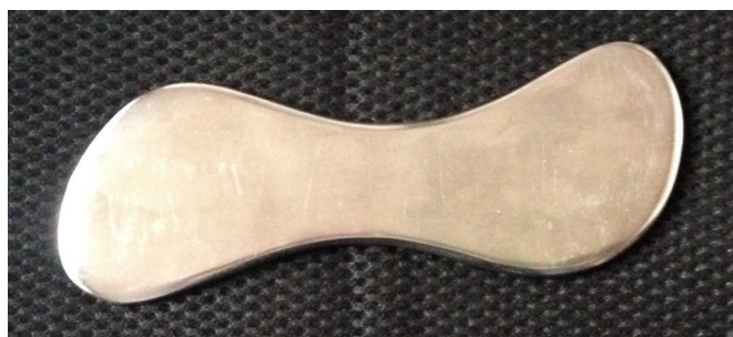
Figure 2. Gua Sha Model (western view)

analyze the statistical importance of the obtained results, being considered the alfa importance level 0.05 (5%).